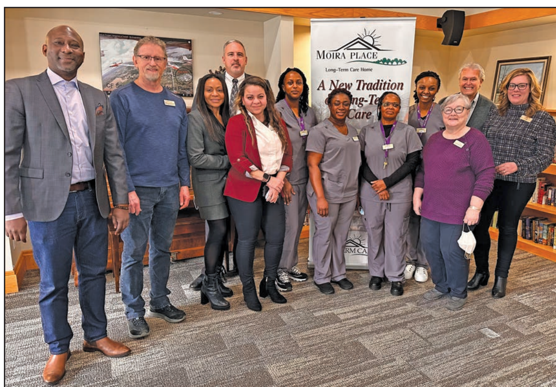
The Tweed News/RODGER HANNA